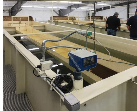
The plant repaired and painted the tanks during the repair-upgrade process. The three updated Westfield units are now in production.