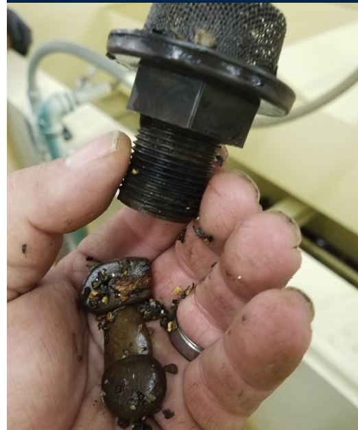
Replacing plugged Adsorption Clarifier nozzles enhanced performance.

The waste volume produced during these processes depends upon the water quality. The higher the turbidity in the raw water, the more