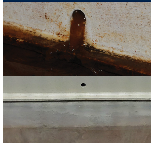
Adsorption Clarifier buoyant media had been leaking from the unit's weep hole.