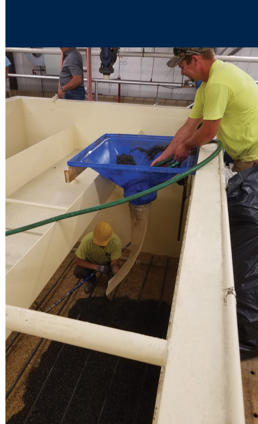
Filter bed media was installed atop the new in-bed air grid for air-water backwashing.

Managers Schuster and Thompson were very pleased with the overall operation of the treatment units. The plant's net production increased, efficiency improved, and the waste production decreased following the repairs and updates. Thompson reported tremendous improvement in solids capture, which saved an impressive 17,761 gallons (67 m 3 ) of wastewater per operating unit per day. Thompson also mentioned that, on average for all three units, the plant's Adsorption Clarifier runtimes changed from 24 hours to 17.4 hours and the filter runtimes went from 12 hours to nearly 29 hours.