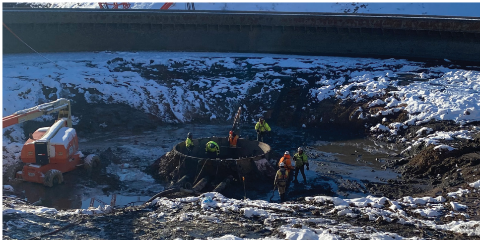
The dirt around the center column proved to be deeper than expected.