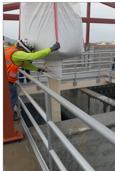
Added sand during process start-up

a small footprint. The RapiSand provides high performance clarification with a space savings of up to 90% when compared to the size of conventional treatment. At Santan Vista, ballasted flocculation is followed by ozonation, media filtration, and chlorine disinfection. This facility also has the ability to recycle filter backwash and clarified underflow using a WesTech SuperSettler™ lamella-type plate clarifier.