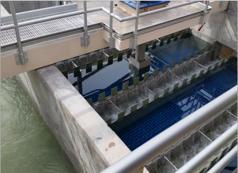
High-rate sedimentation process tank