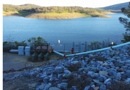
Surface water is pumped to the plant from Folsom Lake.