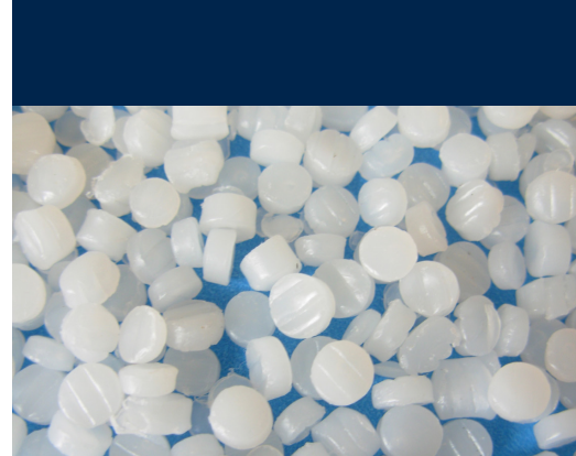
Adsorption Clarifiers use buoyant media in an upflow system design.