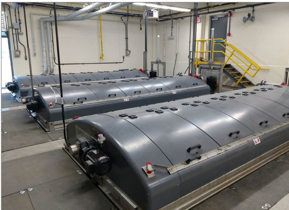
The plant's three-unit SuperDisc phosphorous removal system

The plant's SuperDisc phosphorous treatment system meets the plant's tertiary wastewater delivery needs, providing backup capacity and the ability to operate without downtime during routine maintenance. The effluent averages less than 0.1 mg/L of phosphorous per month.